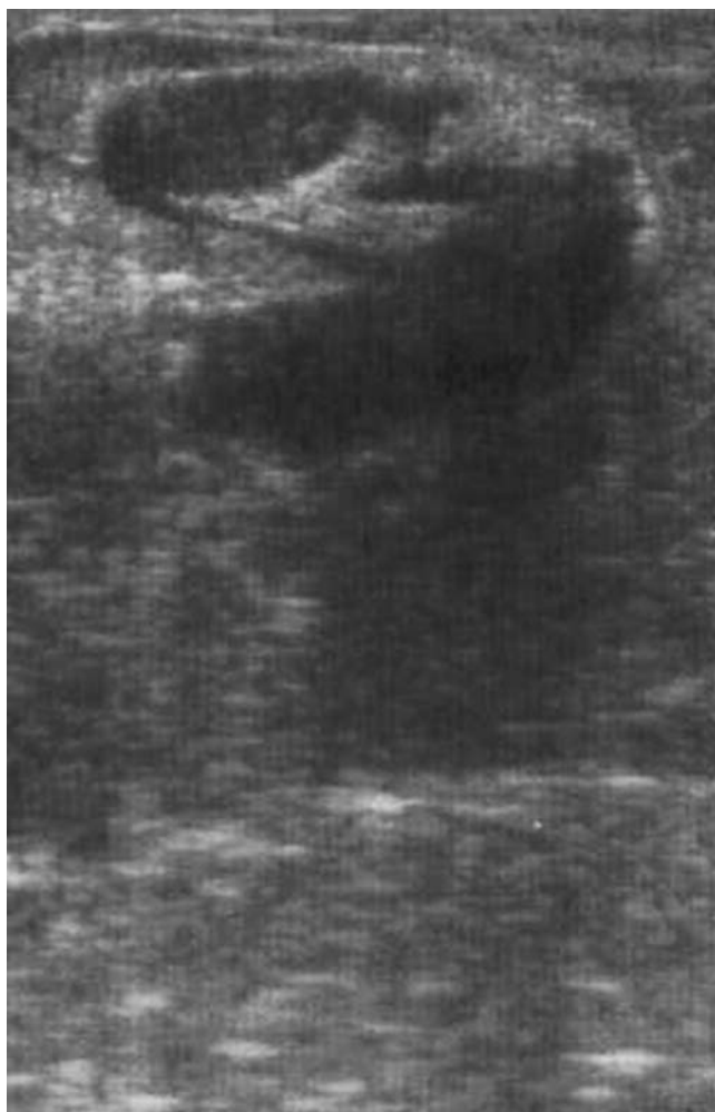
Figure 2. Ultrasound image of subcutaneous abscess showing irregular hypoechoic oval collection in subcutaneous tissue.

procedure, which included 12 percutaneous aspirations, 33 incision and drainage procedures, and 13 combination aspirations and incision–drainage procedures. Of these, 54 patients had fluid recovered, which included 46 with purulent collections (pus), 4 with serous collections, 2 with liquefied hematomas, and 2 with bloody serous collections. The five patients with sonographic fluid but no drainage procedure had very small collections (<1 cm diameter) and were discharged on antibiotics by treating